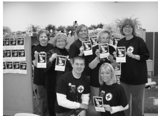
American Red Cross volunteers and staff launch the 'Pint for Pint' 97.9X blood challenge.