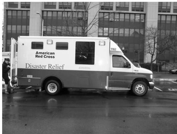
Disaster services volunteers prepare the Emergency Response Vehicle for deployment.