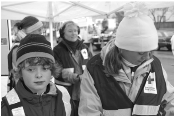
American Red Cross volunteers lend their support at the Thanksgiving Turkey Handout